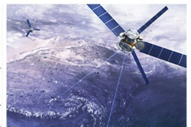
Aerospace & Satellite Imaging

All SmartLF scanners are available in three affordable specification levels: monochrome, color and express color, (m, c, e). m and c models can be easily upgraded via unique email process if requirements change.