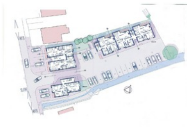
CAD and Technical Drawings

Colortrac has the longest experience of manufacturing CCD-based wide format color scanners. The SmartLF Gx+ 56 scanners offer a combination of long-life, maintenance free bi-directional LEDs with power saving ENERGY STAR® compliance and high productivity scanning speeds. The 6th generation SmartLF Gx+ CCD scanner ranges define a new industry benchmark for high fidelity color, monochrome tone reproduction and image sharpness.