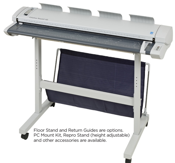
Floor Stand and Return Guides are options. PC Mount Kit, Repro Stand (height adjustable) and other accessories are available.