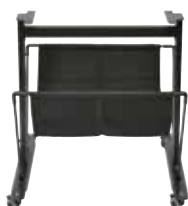
Optional stand for easy movement and storage.