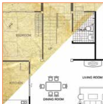
Improve your originals