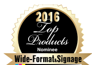
SD One nominated