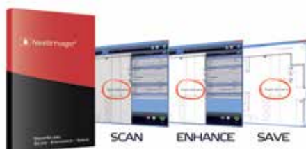
Optional Nextimage Scan+Archive More file formats and improved image controls.