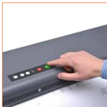
Flexible control panel for easy handling

Scan and document all your architectural, engineering and construction plans in standard file formats directly into your project folders.